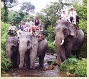
Elephant Trekking with a difference

After Lunch Teams will have to find an elephant trekking venue, where they will be taken into the jungle. They will then be given 15 minute to find as many edible plants as they can. These must be photographed as evidence of their discoveries.